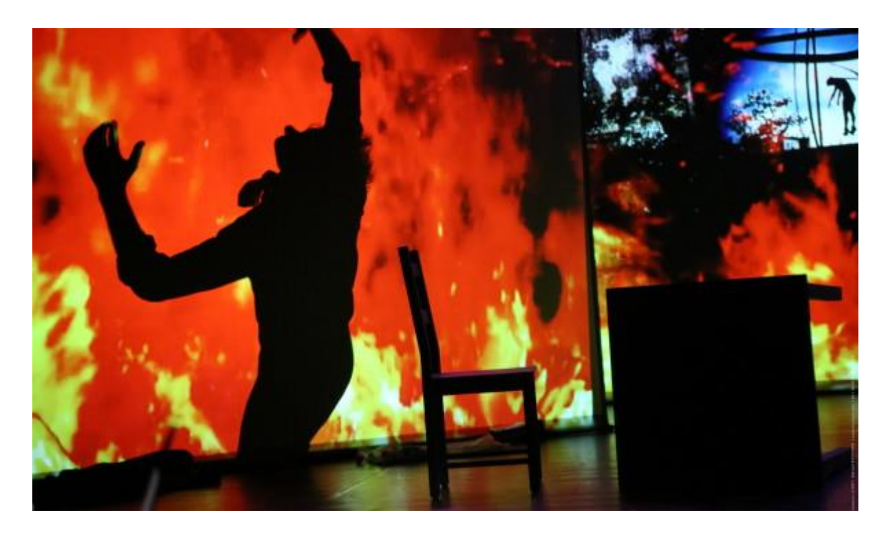
Musik- und Tanztheater

für einen Tenor, zwei Tänzer, einen Schauspieler und Barockensemble nach der Novelle "The Black Cat" von Edgar Allan Poe